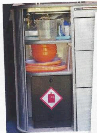
The gas locker and cupboard inside the camper