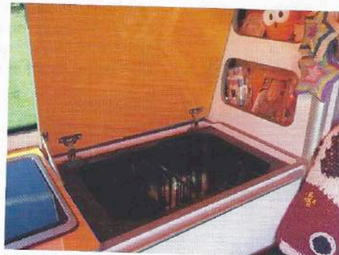
The voluminous top-loading fridge is perfect for summer camping

was the freedom, as I didn't have to be there for Dad anymore. So those two things are equally important. I could never have left dad, but I couldn't have got the camper without his help."