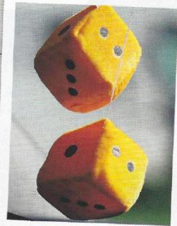
How can you go wrong with fuzzy dice in your campervan cab?

wonderful experience, as a kind of proof that I could do it, and that I didn't need anyone to help me. Sometimes, if the wind was blowing and it was raining I'd think: 'This is crazy. What am I doing?' But it has been a really, really good experience.