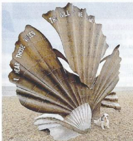
The Scallop is a landmark on Aldeburgh beach

Ryder-Davies & Partners Walnut Tree Avenue Rendlesham IP12 2GG T: 01394 420964