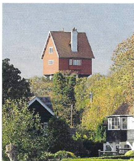
The House in the Clouds basks in autumn sunlight