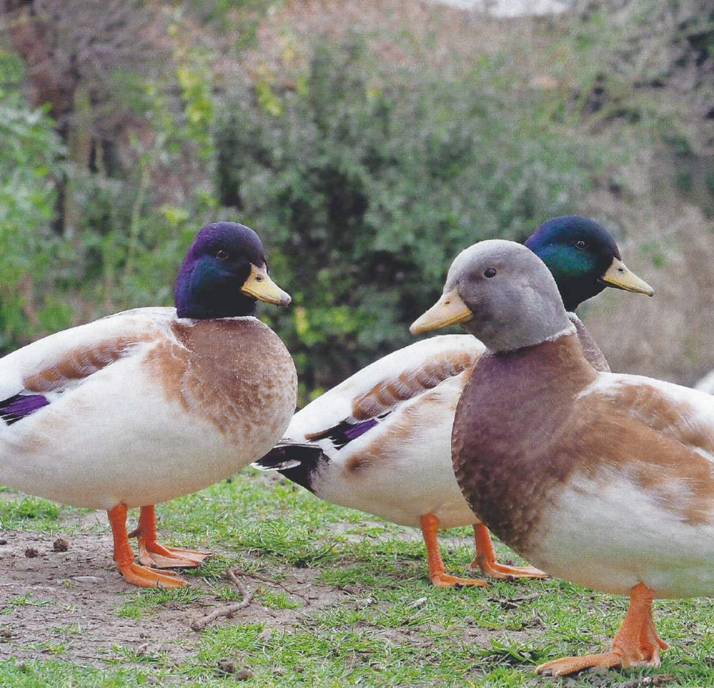
ABOVE: Resident ducks are part of village life at Westleton