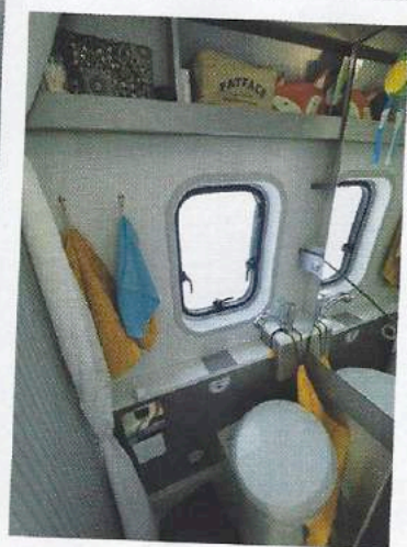
The washroom in our Adria is really well designed for long-term travelling...