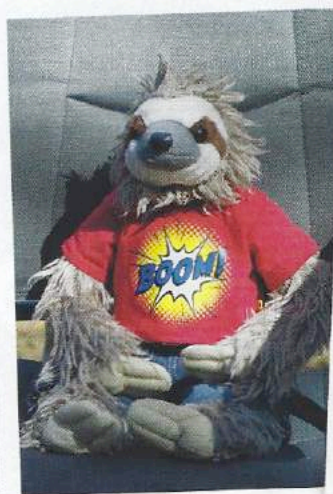
Sid the Sloth, all set to hit the road in the campervan!